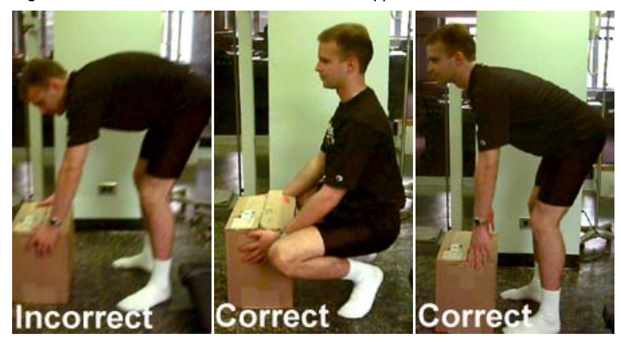
Keys to Doing Repetitive Movements